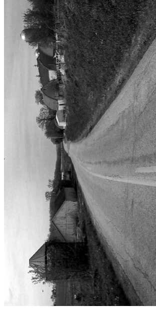
On scenic Locust Dr.